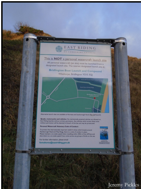
New Sign at South Landing

To accompany this new guidance, leaflets were produced and placed at key locations along the coastline, supported by local media coverage. Later in the year a unique sign was installed at South Landing (Flamborough) to discourage unauthorised PWC launches. Additional signs for local launch sites will follow in 2017. A review meeting took place in November in which the voluntary code of conduct was reaffirmed and minor amendments to the code of conduct leaflet were agreed.