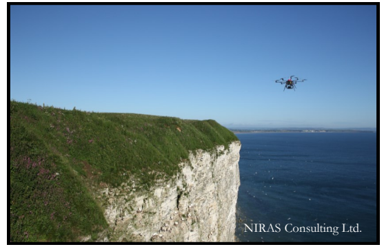
The UAV in use at Bempton Cliffs

The RSPB, working alongside DONG Energy and Natural England, also carried out a pilot study to determine whether conducting colony counts by an unmanned aerial vehicle (UAV or drone) would be feasible. This survey, commissioned by DONG Energy and carried out by NIRAS Consulting Ltd., indicated that the UAV performed well with no significant disturbance to the seabirds. The images produced were of sufficient quality to allow for the identification of species and of breeding and non-breeding birds. It should be noted that special permission was obtained from Natural England for this study and the use of drones or UAVs within a protected area is strictly regulated.