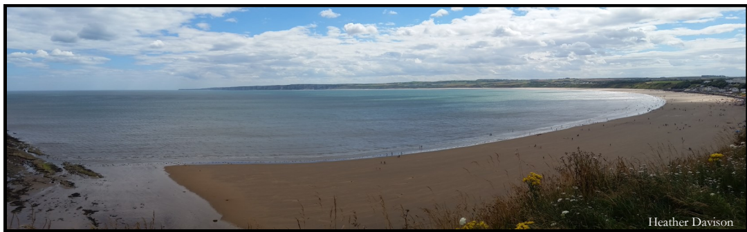
Flamborough Headland from Filey Bay

The Project Officer will continue to offer support and guidance to Authorities and will work closely with each organisation to identify any future funding opportunities. Similarly, the Project Officer will maintain involvement in active external funding bids for partnership projects with Key Partners, where appropriate, and will look to identify other potential areas of joint-working.