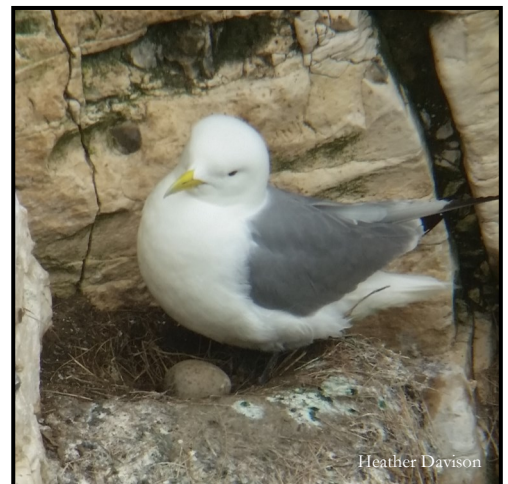
Kittiwake with Egg at Briel Nook

A revised Regulation 35 (formerly 33) Conservation Advice package is currently in preparation. This package offers site managers and other interested parties advice about what activities could negatively affect the conservation features of the protected area, along with general information about management. In early 2016, the EMS Project Officer completed a secondment with Natural England in order to assist in the development of the package and will continue to feed in to the process, where appropriate, until completion. A draft document is expected to be available to key stakeholders in spring 2017. All Authorities and stakeholders should note that, until the Regulation 35 advice is officially published, the Regulation 33 Conservation Advice should still be used to inform the decision-making process. This document can be viewed on Natural England's website .